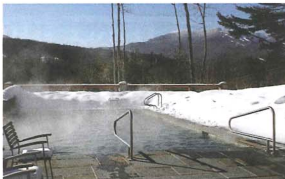
No matter what the season, you can unwind with a swim in the outdoor heated pool at Topnotch Spa in Stowe, Vt.

signature Chocolate Bean Polish. For the ultimate sweet treat, savor the new Cocoa Facial Experience, an anti-aging treatment using cocoa's natural antioxidants. Not a fan of chocolate? There are non-chocolate options, including the Cuban Experience and Hershey Gardens packages.