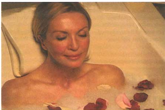
Top Left and Right: Guests at the Spa at Hershey Hotel enjoy sweet treatments like a Cocoa Facial Experience. Above: Soak in the restorative sulphur spring waters at The Greenbrier.